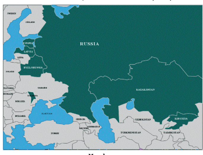
Members: Byeloruss; Estonia; Kazakhstan; Kirghizstan; Latvia; Moldova; Russia