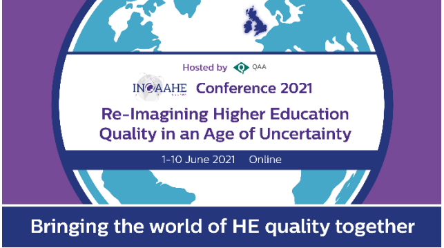
INQAAHE Conference 2021 - United Kingdom (online)